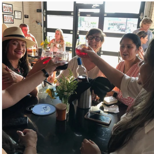
Sips and Gulps